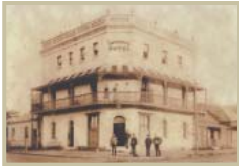
The Imperial Hotel built in 1886 now the Empire Hotel

For more information please contact: Shoalhaven City Council Visitors Centre Pleasant Way, Nowra on Telephone: (02) 4421 0778 Email: tourism@shoalhaven.nsw.gov.au www.shoalhaven.nsw.gov.au