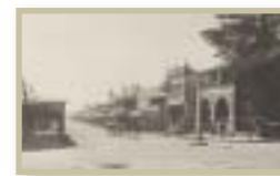
Junction Street Nowra